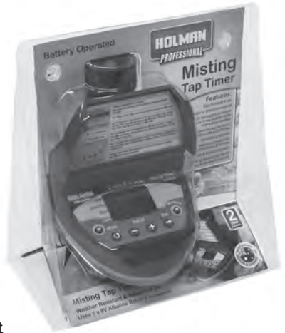
Misting Timer Product Code: CO3009

The Holman “Misting System” tap timer is particularly well suited to watering the Green-Wall because it can be programmed down to minutes and even seconds. This will allow you to work out the ideal maximum watering time that minimises the amount of “waste” water from the system. With a little patience you will be able to program the precise amount of time required to just moisten the mix in the pots. Also it is possible to water at very regular intervals. Say every 4 or 6 hours for a duration of perhaps of 30 seconds or 1 minute each time. Regular watering will prevent the soil from drying and will help to maintain vigorous plant growth.