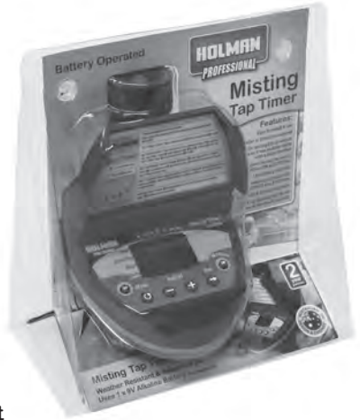
Misting Timer Product Code: CO3009

The Holman “Misting System” tap timer is particularly well suited to watering the Green-Wall because it can be programmed down to minutes and even seconds. This will allow you to work out the ideal maximum watering time that minimises the amount of “waste” water from the system. With a little patience you will be able to program the precise amount of time required to just moisten the mix in the pots. Also it is possible to water at very regular intervals. Say every 4 or 6 hours for a duration of perhaps of 30 seconds or 1 minute each time. Regular watering will prevent the soil from drying and will help to maintain vigorous plant growth.